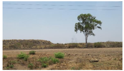
Group1 activity field Discuss a sustainable green site with KMC. Fence, borehole, shelter ··· would be needed.